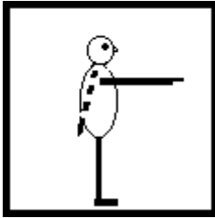
I acknowledge your white flag.

9.15.3 The launch director will give each competitor permission to take-off according to the signals as published. The competitor may then take-off at will, subject to any instructions from the launch director at the time.